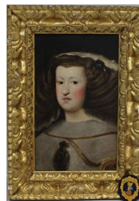
Portrait of Mariana of Austria, offered as the work of Diego Velázquez

Art forgery is one of the lucrative criminal undertakings in Spain, often named in the same breath as the drug trade, weapons trafficking, and prostitution. I've previously written about confiscated forgeries and counterfeit rings broken up by Spanish authorities. Spain is a country that places an immense amount of pride in its national heritage and dedicates large amounts of government resources to trying to protect it. This fact, therefore, makes these forgeries all the more baffling. Even without doing too much work, a casual viewer might recognize one of the forgeries as a portrait of Mariana of Austria, wife of King Philip IV, which now hangs at the Palace of Versailles. The fake is a bust-length cropped version of the original that cuts out her dress's distinctive pannier hoop skirt. Velázquez executed the original work around 1660 when the queen was 26-years-old. Though the 1660 portrait is not as iconic as Velázquez's full-length 1653 portrait that now hangs at the Prado Museum, the queen's stoic expression, rosy cheeks, and wide, braided hairstyle are equally as distinctive as the queen's dress. The suspects were asking for €50 million just for the Mariana portrait.