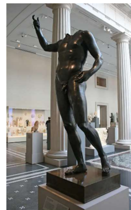
The bronze statue, allegedly of the Roman emperor Septimius Severus, confiscated from the Met

Over the past three months, the Manhattan District Attorney's office confiscated eighteen items from the Met's collection. The alleged Septimius Severus statue is one of several works that the DA's office is repatriating to Turkey, including another bronze statue valued at $1.25 million showing the face of Septimius Severus's son, the emperor Caracalla . The DA's office is handing over twelve items valued at $33 million to Turkey's consul-general in New York. But these were only the most recent antiquities to catch the authorities' attention. Before authorities seized the Septimius Severus statue, the Met announced its plans to remove fifteen Indian sculptures from its collection. This was mainly because of their suspected connections to the disgraced Manhattan antiquities dealer Subhash Kapoor, who was arrested in 2011 and convicted in India just last year of burglary and illegal export. But while the Met removed these pieces from their collection without the DA having to come in and seize them, the museum administration was prompted to take action after the New York Supreme Court granted a warrant for their confiscation.