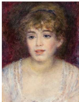
Portrait of Jeanne Samary by Pierre Auguste Renoir

life in the collection of the same aristocratic family line. The portrait's subject, Jeanne Samary, was a prominent French actress who mainly performed at the Comédie-Française. Renoir created many portraits of her between 1877 and 1881, using her as a model in one of his more famous works, Luncheon of the Boating Party (she can be seen in the upper right-hand corner talking with two men). Expected to sell for no more than €1.5M, Renoir's portrait sold for €1.65 million / $1.8 million (or €2M / $2.24M w/p).