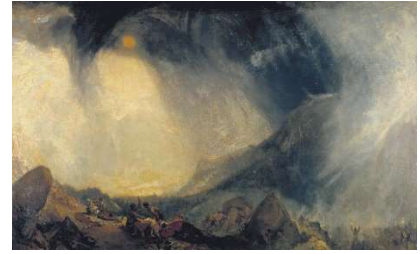
Snow Storm: Hannibal and his Army Crossing the Alps (1812)