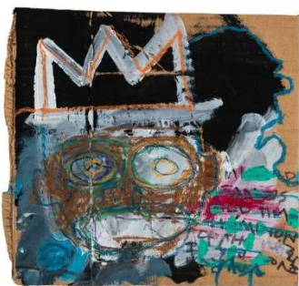
1Untitled (Self-Portrait or Crown Face II), one of the Orlando Basquiat forgeries