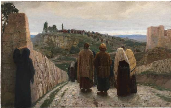
There were also women looking from afar off by Vasili Dmitrievich Polenov

On Wednesday, March 29th, Bonhams New Bond Street location in London hosted its 19th Century and British Impressionist art sale, featuring seventy-three works by both British and Continental European painters (w/p = with buyer's premium). What ended up being the sale's star work was expected to be among the top lots, but Wednesday's bidders brought it right to the top. It was a 1908 oil-on-canvas painting by the Russian artist Vasili Dmitrievich Polenov, with the very long title There were also women looking from afar off . If you're unfamiliar with where the title comes from, you might not know that the work is a biblical scene. All the figures in the foreground have their backs turned to the viewer. The men and women are on the road looking off into the distance at a hill, where a group of people is gathered. The title of the painting comes from the