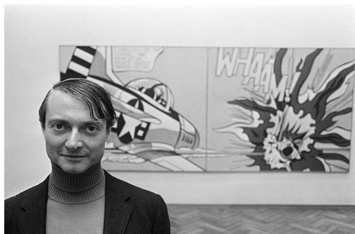
Roy Lichtenstein standing in front of his work Whaam!

Roy Lichtenstein became one of the most prominent names in American pop art in the 1960s, entering the broader cultural consciousness through his paintings resembling comic strips from pulp magazines and noir serials. Today works like Whaam! and Masterpiece are some of the most recognizable examples of the pop art genre and twentieth-century art in general. But even decades after their creation, Lichtenstein's works are not without their critics, especially when it comes to one of the most pervasive criticisms of pop art: copyright and plagiarism.