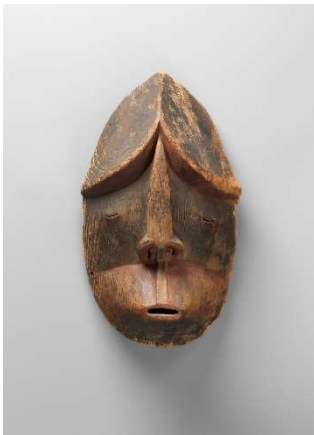
One of the Alutiiq masks from the Diker collection currently owned by the Metropolitan Museum of Art