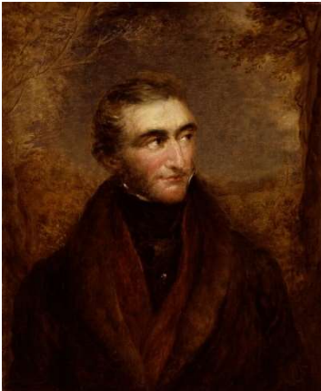
J.M.W. Turner by John Linnell

Joseph Mallord William Turner is probably one of the most beloved of Britain's artists. He created works of art which are now recognizable symbols of the British artistic tradition, as well as pioneered techniques that would become the basis of great modern art for the next two hundred years. He was both lauded and lambasted in his lifetime, but he is now often named, along with Joshua Reynolds, John Everett Millais, Thomas Gainsborough, and John Constable, as one of Britain's greatest painters. Today, April 23rd, is his 248th birthday.