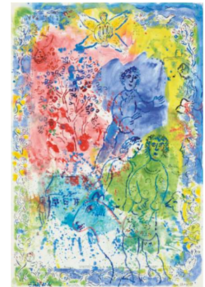
Rencontre multicolore avec le peintre pour le concert by Marc Chagall

Only a single lot sold within estimate, Rencontre multicolore avec le peintre pour le concert , a work of gouache, tempura, and ink on paper created in 1974. The piece is everything you expect from a work by Marc Chagall, with bright pastel blues, greens, and reds, somewhat floating human figures, and a little bit of Jewish symbolism with a four-winged angel holding a menorah. Christie's specialists estimated Rencontre to sell between €200K and €300K, with the hammer coming down at €280K / $305.57K (or €352.8K / $385K w/p). The lot that came right after it achieved the same hammer price: Violoncelliste rouge et bouc jaune dans un ciel sombre . It is a work of gouache, pastel, and ink on paper created in 1981, and by reaching a €280K hammer price, it exceeded its €180K high estimate by about 56%.