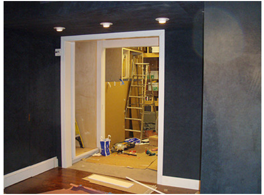
Construction in the Third Gallery