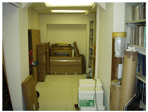
Almost Empty Storage Room

Below are a few updated photos of the gallery and the 'almost' empty storage room: