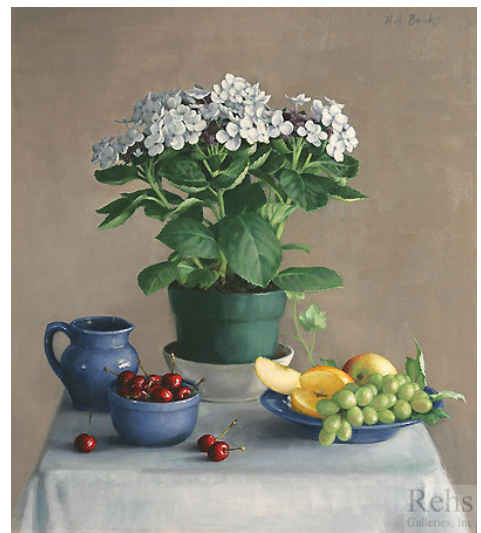
Holly Banks White Hydrangea and Fruit