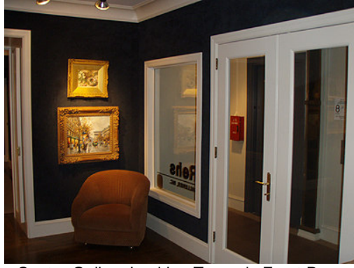
Center Gallery Looking Towards Front Door