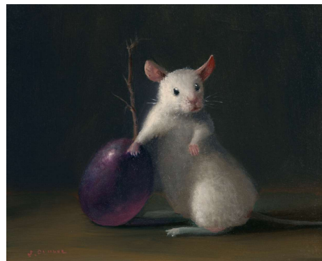
Stuart Dunkel Finders Keepers

Next Month: Probably more art market news!