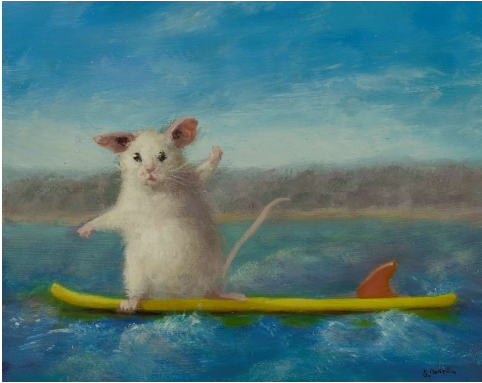
Stuart Dunkel Hanging 5