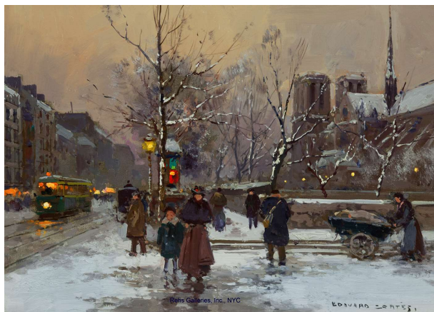
Edouard Cortes Quai de Montebello in Winter