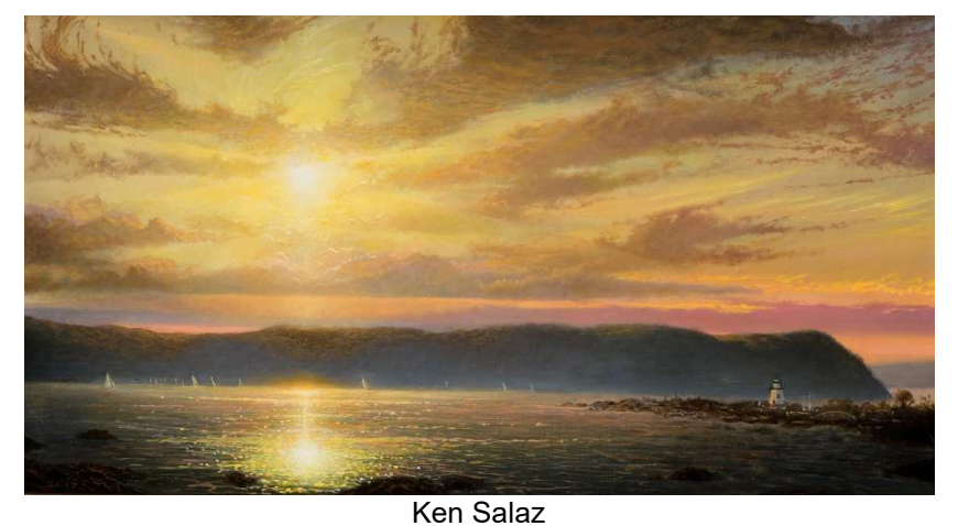
The Day I Met You: Sunset Over Nyack from Tarrytown

Next Month: We should have more public sales to cover.