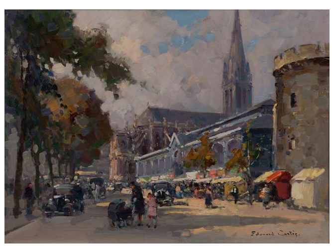
Edouard Leon Cortes Scene de Village